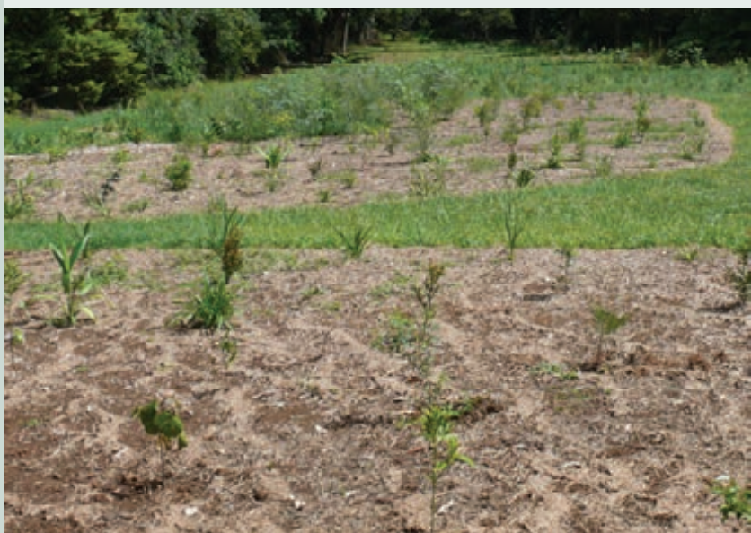
An area of revegetation that is round or square, rather than a long narrow strip, is less prone to weed invasion and more protected from wind and other disturbances.

Shape is important, because bushland with a small perimeter or edge length relative to its area has greater resilience against threatening processes. For example, an area of bushland that is round or square will be less prone to weed invasion than a long and narrow strip, which has a greater area of bush “accessible” to the invasion of weeds (refer to Land for Wildlife Note G1 - Healthy Ecosystems and Your Property ).