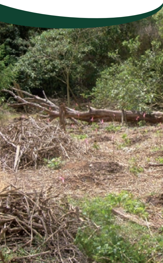
Riparian revegetation project along the Upper Stanley River.