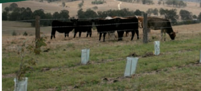
A fenced revegetation site at Mount Barney.