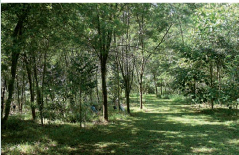
This five year old revegetation site at Reesville, Sunshine Coast, planted Green Wattle ( Acacia irrorata ) as a fast growing pioneer species to quickly capture the site and protect slow growing rainforest trees.