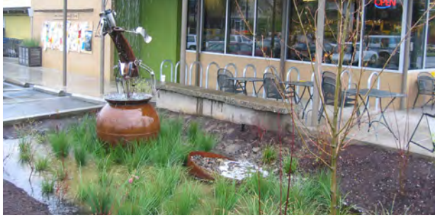
New Seasons, 20th and SE Division St., Portland

The entire water quality treatment area should be planted appropriately for the soil conditions. Walled infiltration run-on planters will be inundated periodically. Therefore the entire planter