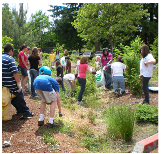
Fowler Middle School, Tigard

Clean Water Services Design and Construction Standards