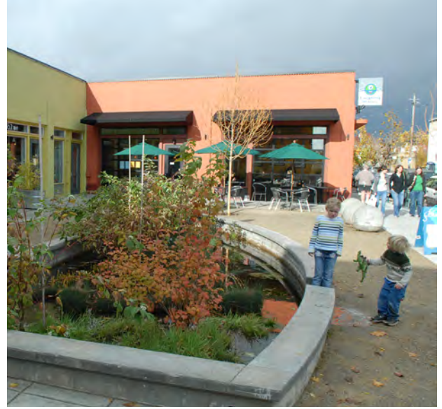
Mississippi Commons, NE Portland