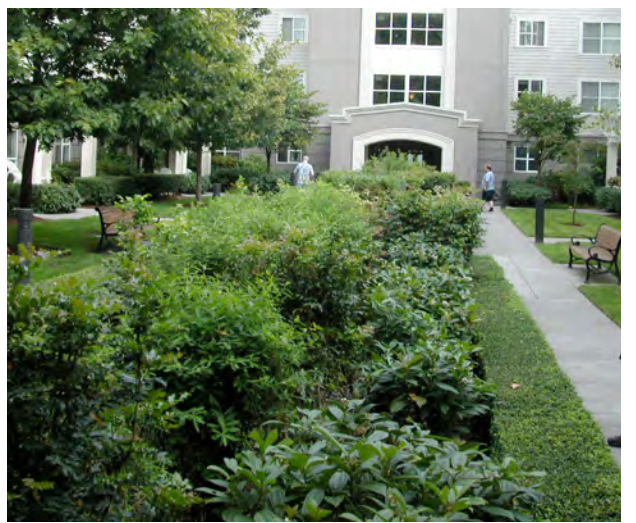
Buckman Terrace Apartments, Portland