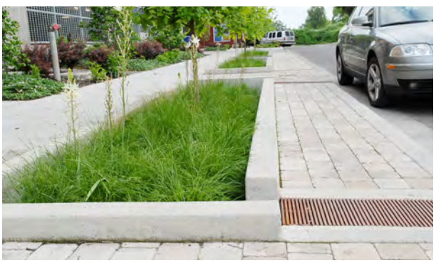
Beaumont Village Lofts, NE Portland

Infiltration planters should be integrated into the overall site design and may help fulfill the landscaping area requirement. Infiltration planters can be used to manage stormwater flowing from all types of impervious surfaces, from private property and within the public right-of-way. Check with the local jurisdiction if proposing to use infiltration planters in the public right-of-way. The size, depth, and use of infiltration planters are determined by the infiltration rates of the site's existing soils.