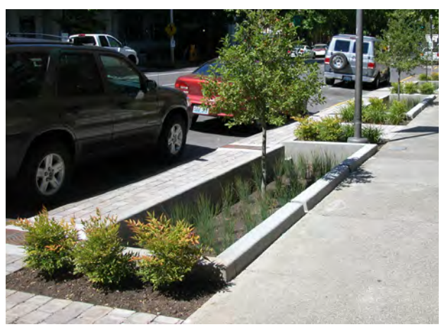
12th and Montgomery St., Portland